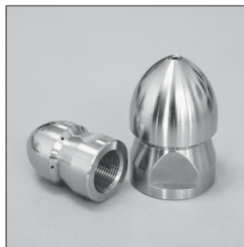
Ball Type Model GE