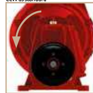
ELBA 6500 1:3 Splined shaft 1"3/8 - Z6 ISO 500