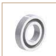
Heavy duty bearings