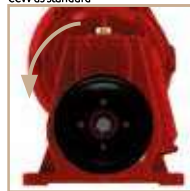
ELBA 3500 1:3 Splined shaft 1"3/8 - Z6 ISO 500