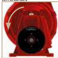
ELBA 6500 1:4 Splined shaft 1"3/8 - Z6 ISO 500