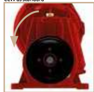
ELBA 3500 1:4 Splined shaft 1"3/8 - Z6 ISO 500