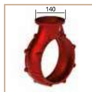
Ø 140 mm scroll ELBA 6500