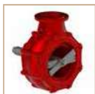
Cutting device ELBA 6500