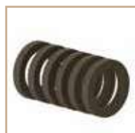
Preshaped Ring ELBA 3500